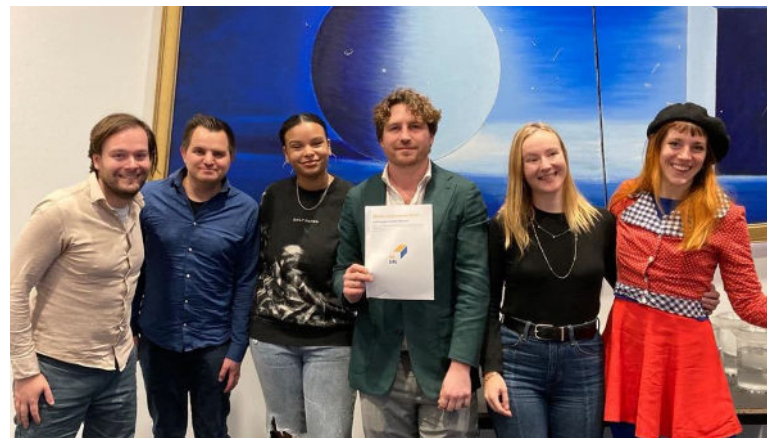
Youth Board members present their RPA to the Amsterdam alderman for housing production.

Learn more about how the UPLIFT Reflexive Policy Making process was implemented in four specific locations and gain a detailed insight into their implementation by looking at the Guidebook on developing the Reflexive Policy Agenda at https://uplift-youth.b-cdn.net/wp-content/uploads/2023/04/D4.8-Guidebook-on-RPA.pdf