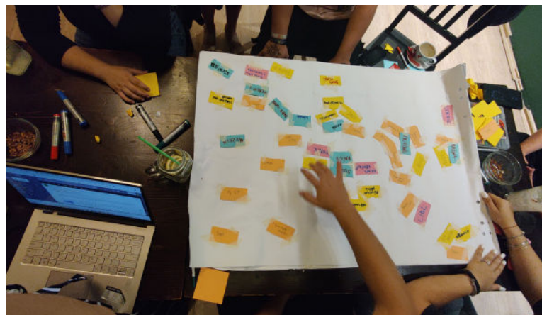
Empowering exercise about creating an ideal city.