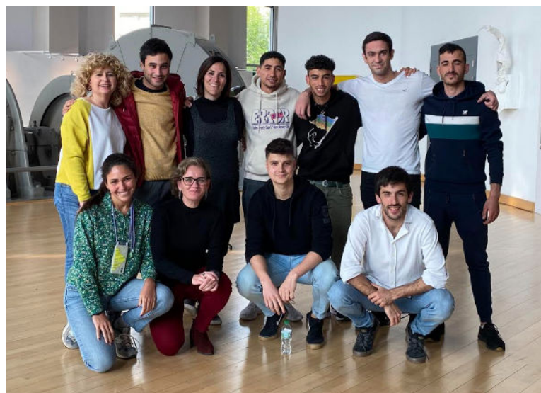
Barakaldo Youth Board.